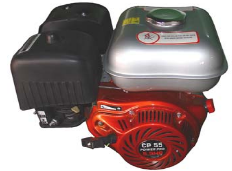
POWER PRO PETROL ENGINE

Port Elizabeth 20 – 6th Ave, Walmer Tel: 041 581 8443/4/5 Fax: 041 581 8446